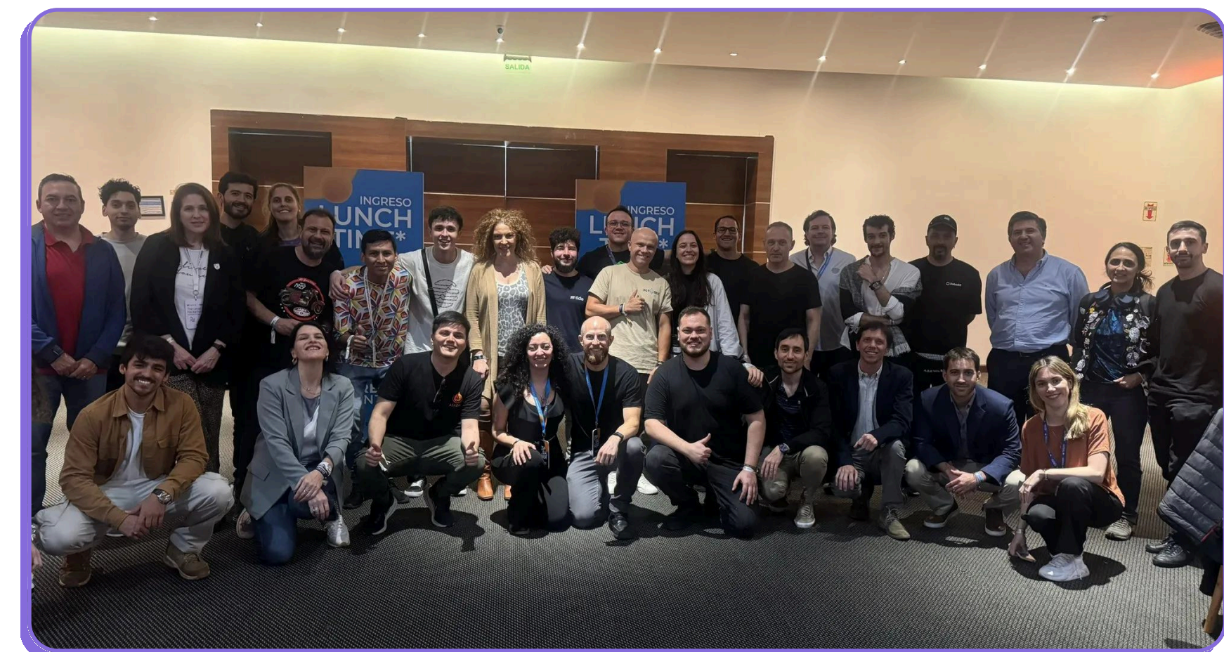
(1) Gathering of key representatives from the Argentine academic sector with members of the Ethereum Foundation, held within the framework of Ethereum Argentina 2024.

You can read more about our participation in Merge at the following link .